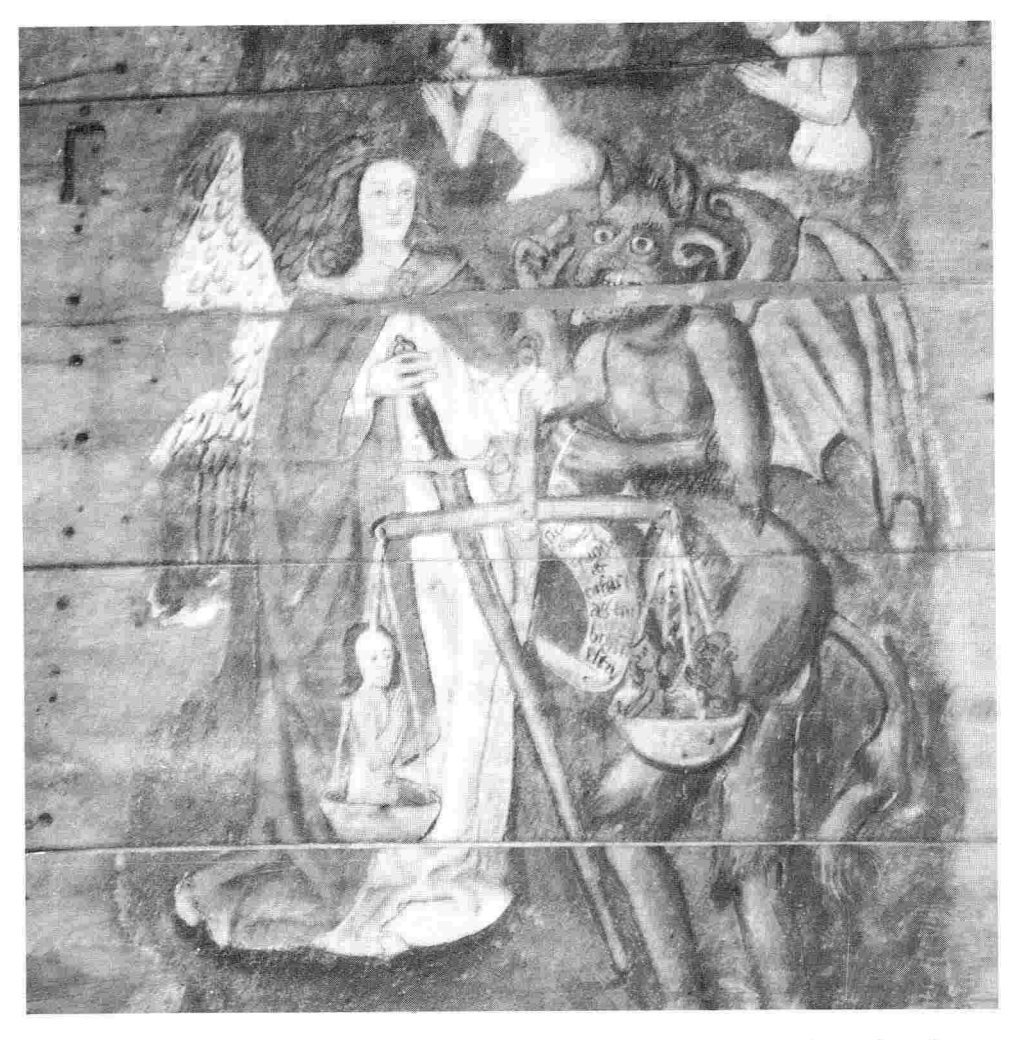
FIG. 83 – Centre lower right compartment of the Doom: St Michael, clothed as an angel, carrying a long sword, weighs deeds. A large devil on the right carries an unrolled scroll

At Wenhaston, the figure drawing conforms to that of the 15th and 16th centuries in having black outlines, but the figures are slender, with well-rounded bellies. The legs of the figures are disproportionately long, and the feet unusually large. The drawing is for the most part careful and refined, facial features clearly demarcated to indicate differing expressions and the flesh tints delicately applied. These characteristics are particularly apparent in the figures in the four bottom panels of the painting and contrast with the cruder drawing of the figures of Christ, the Virgin Mary and John the Baptist. Christ's arms in particular are disproportionate to the body both in length and in their relative placing on the torso. The drawing of the Wenhaston figures, except for those three, is unlike the dumpy rather squat figures which are more characteristic of English figure drawing of this time. There seem to be no exact parallels either in Suffolk or nationally in the material which I have seen. Destruction and damage have taken their toll and of the six Suffolk Dooms listed by Ashby one has been extensively restored; two are in poor