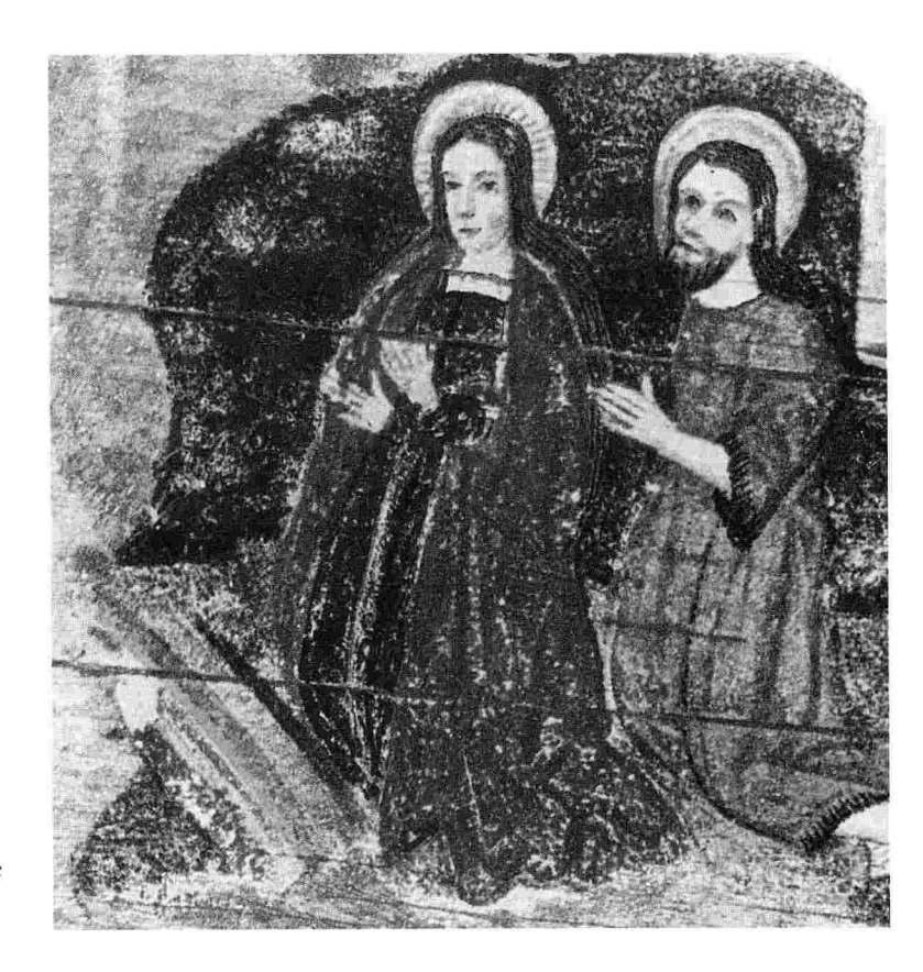
FIG. 86 – Close-up of upper right compartment of the Doom: details of the Virgin Mary's dress.

The picture is thus established of a community well able financially to support the arts including drama. A survey of plays and players between 1330 and 1642 (Galloway and Watson 1980) indicates the pervasiveness of dramatic and related activities in Suffolk, as elsewhere in East Anglia, though the available sources (mainly accounts books and court rolls) do not show