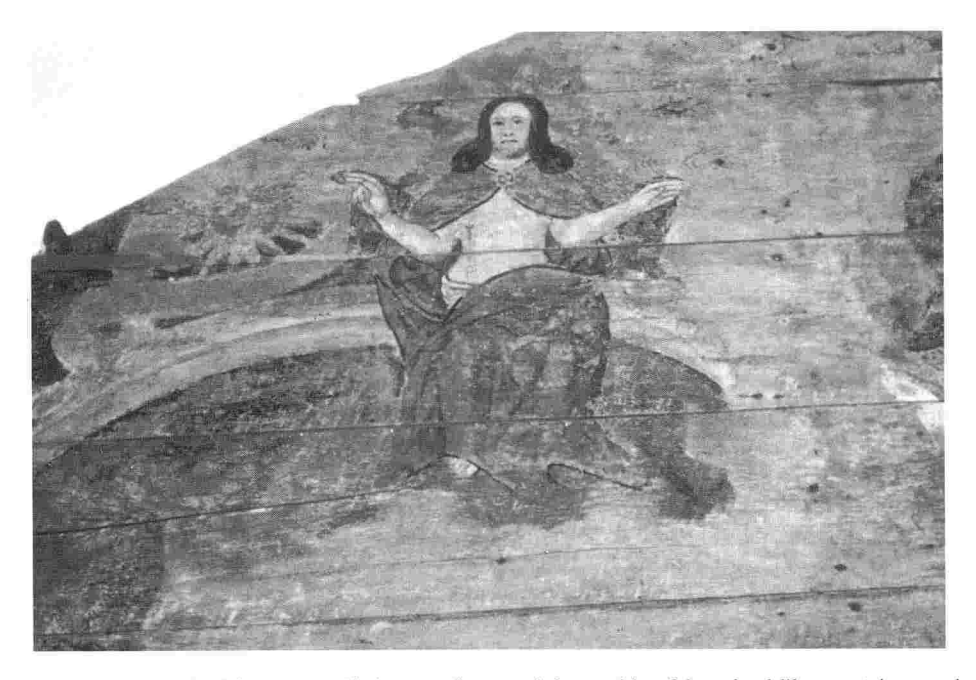
FIG. 80 - Upper third of the Doom: Christ seated on a rainbow, with a faint wheel-like sun.

The painting measures 5.25m at its widest and 2.6m in height. It is painted on nine oak boards, the uppermost of which is some 15cm, the remainder 30cm, wide. On the right-hand side, the upper five boards have been shaped to produce a curve which precisely fits that between the