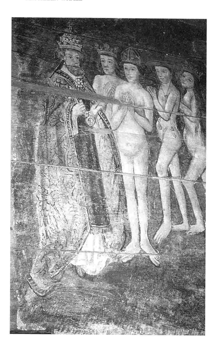
FIG. 84 – Centre lower left compartment of the Doom: St Peter welcomes a king, a bishop, a cardinal and a queen to the Kingdom of Heaven.

act of ancient tradition and a potent symbol of assessing actions and determining destiny. Concepts of Greek and Roman law with the allegorical figure of Justice, and biblical (Daniel, 27) and classical (Rieu 1950, 146) literary sources, all help to define the importance of Judgement in mankind's affairs.